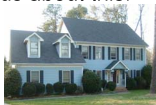
House and Personal Property