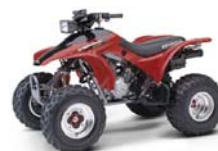
Off Road ATV's