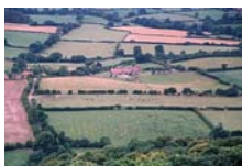
Vacant or Farm Land