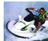
Rental Jet Skis