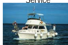
Owned or Rented Boats